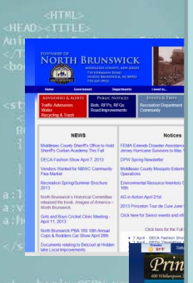
table width="100%" stable width="100%" opcolor="#dddddd" upx #fififif solid; tr

Ordinances codified on an annual basis, with both the code and any un-codified ordinances made available online?